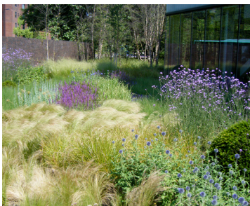
Herbaceous Shrub Planting