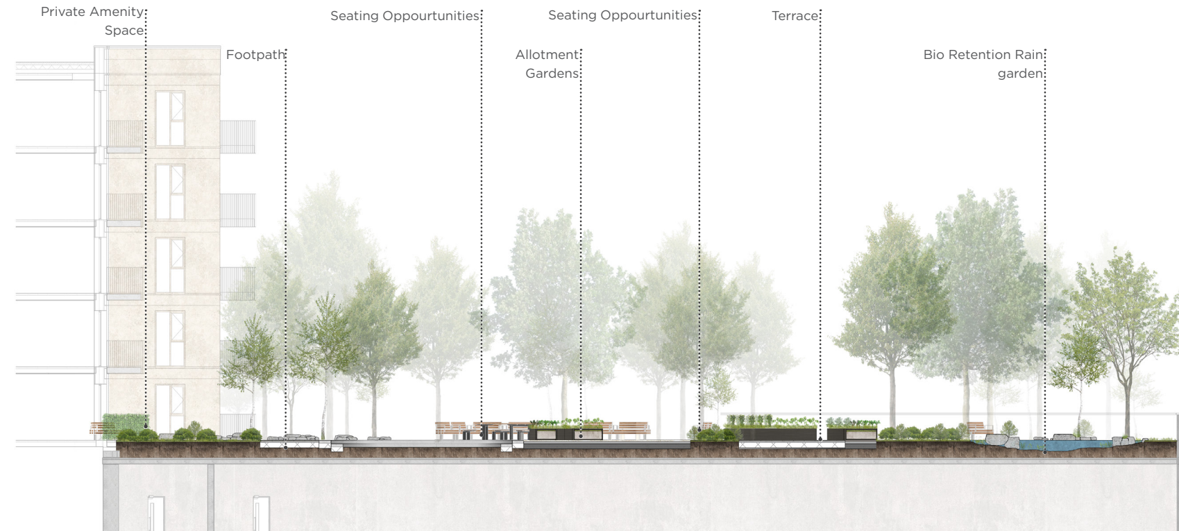
Section through Courtyard B