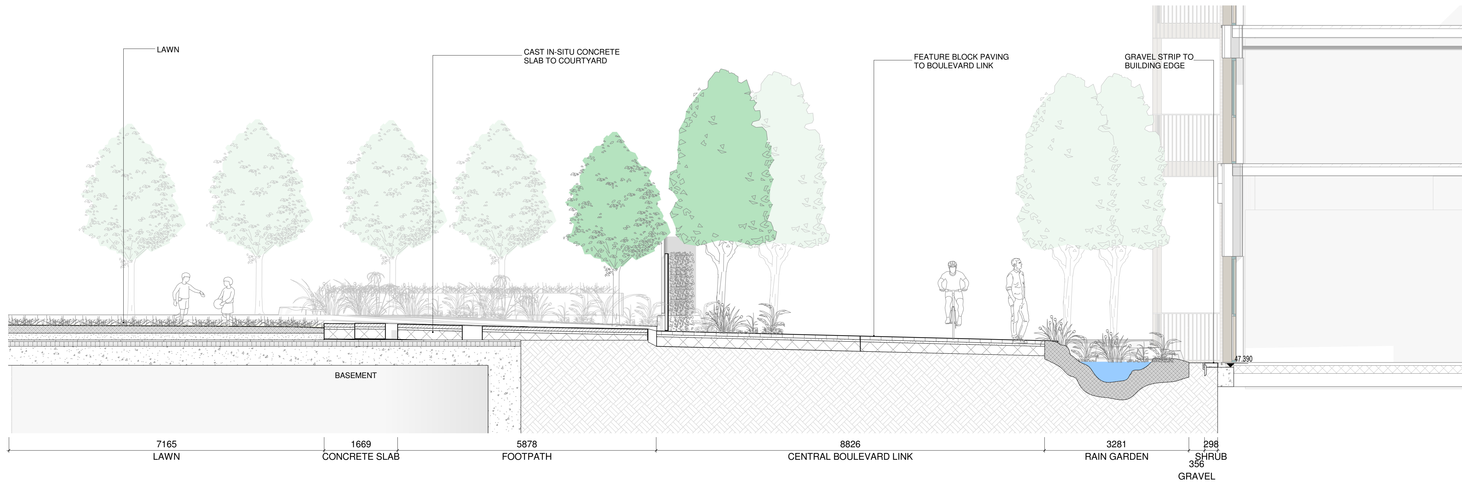
9 SECTION 09 SCALE: 1:50 @A1