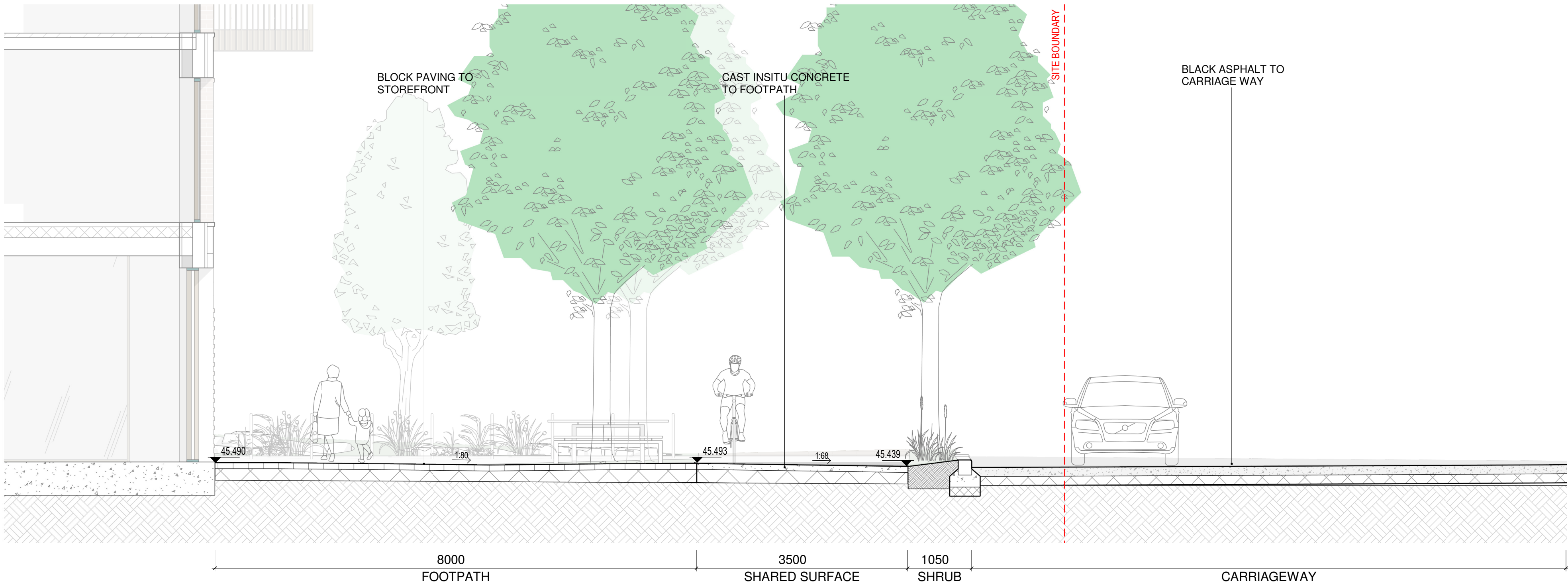
1 SECTION 01 SCALE: 1:50 @A1