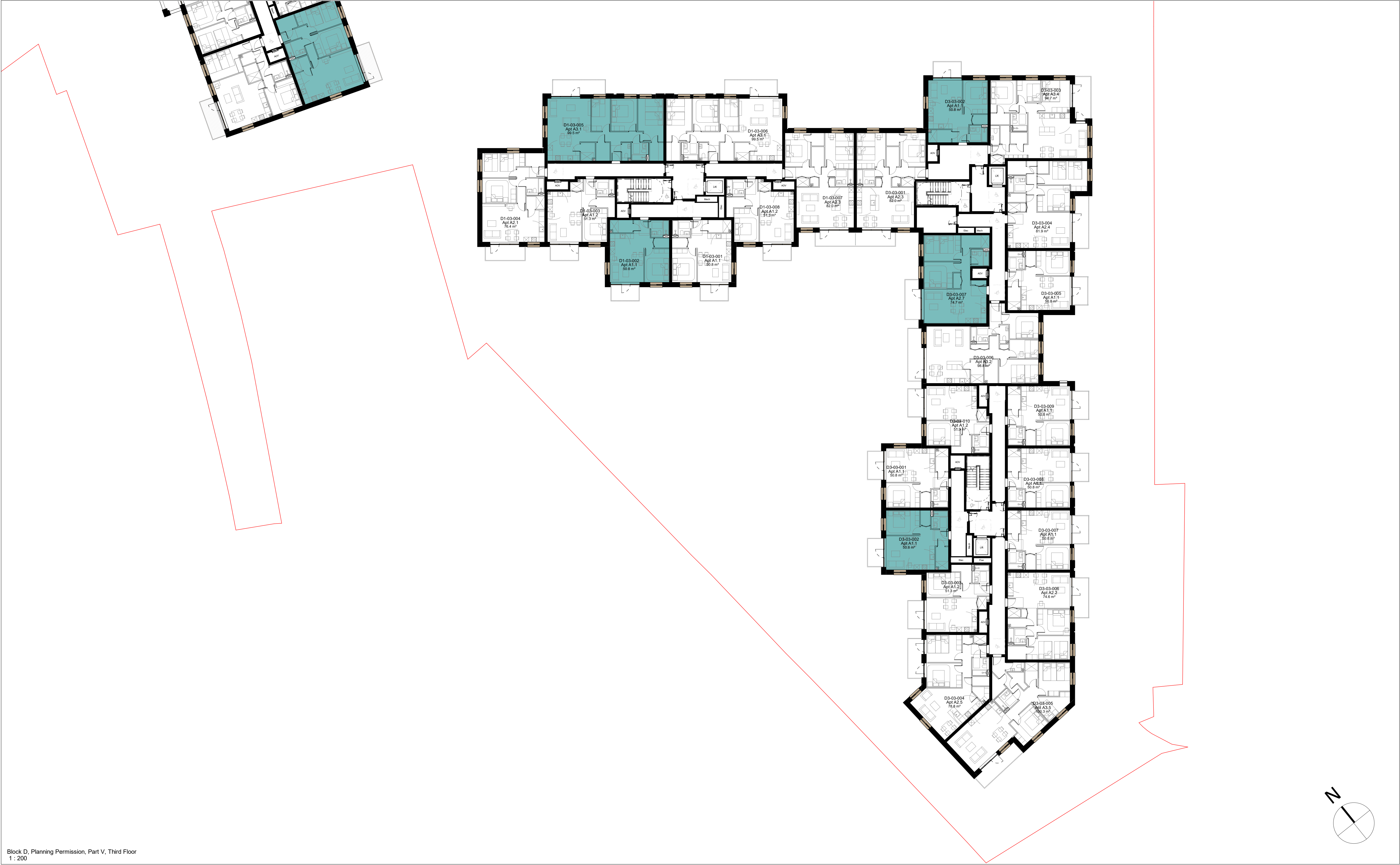
Block D, Planning Permission, Part V, Third Floor 1 : 200

Notes: - Do not scale from this drawing. Use figured dimensions in all cases. - Verify dimensions on site and report any discrepancies to the Architect immediately. - This drawing is to be read in conjunction with the Architect's Specification. - © This drawing is copyright and may only be reproduced with the Architect's permission. Drawing Notes: