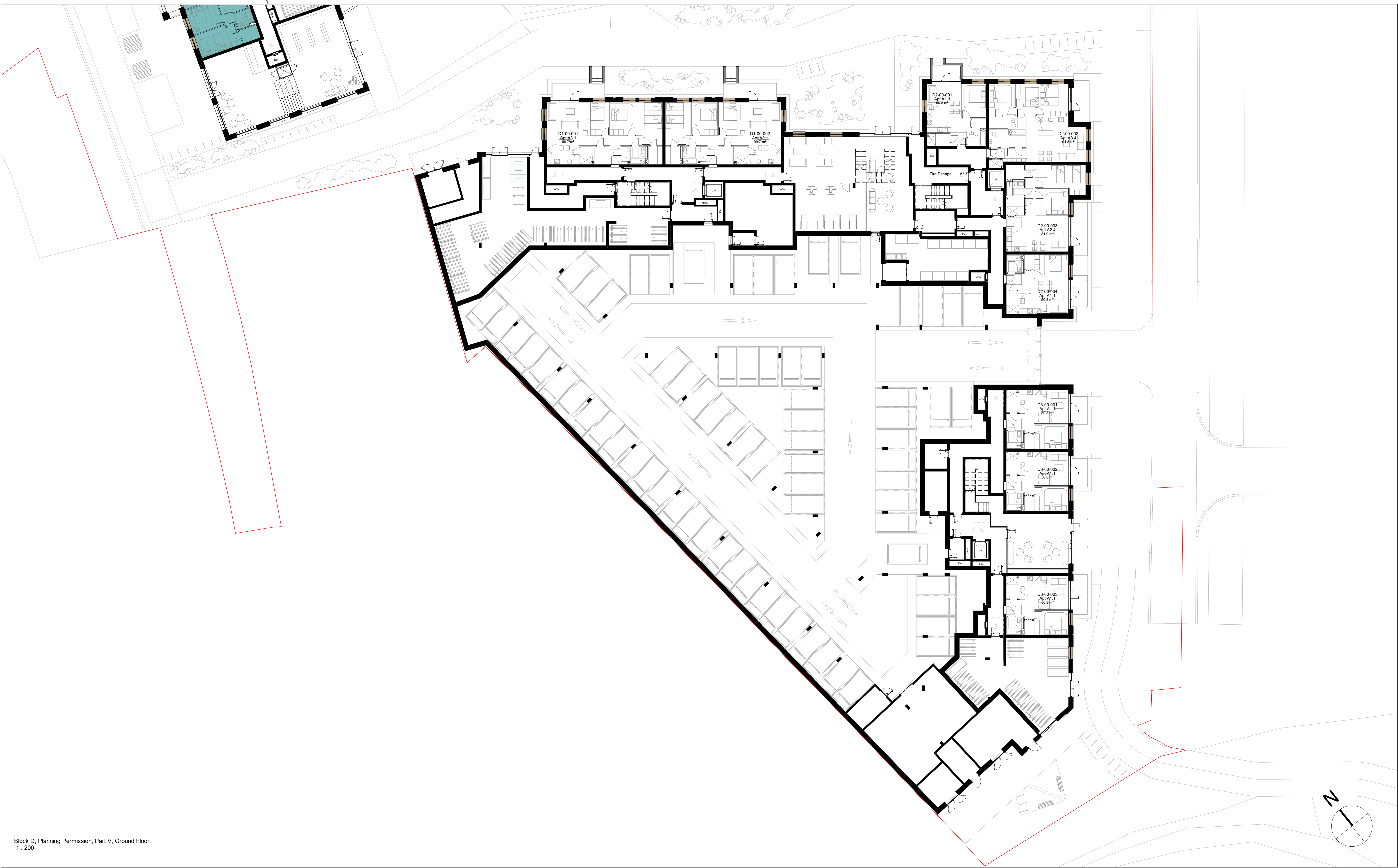
Block D, Planning Permission, Part V, Ground Floor 1 : 200

Notes: - Do not scale from this drawing. Use figured dimensions in all cases. - Verify dimensions on site and report any discrepancies to the Architect immediately. - This drawing to be read in conjunction with the Architect's Specification. - © This drawing is copyright and may only be reproduced with the Architect's permission. Drawing Notes: