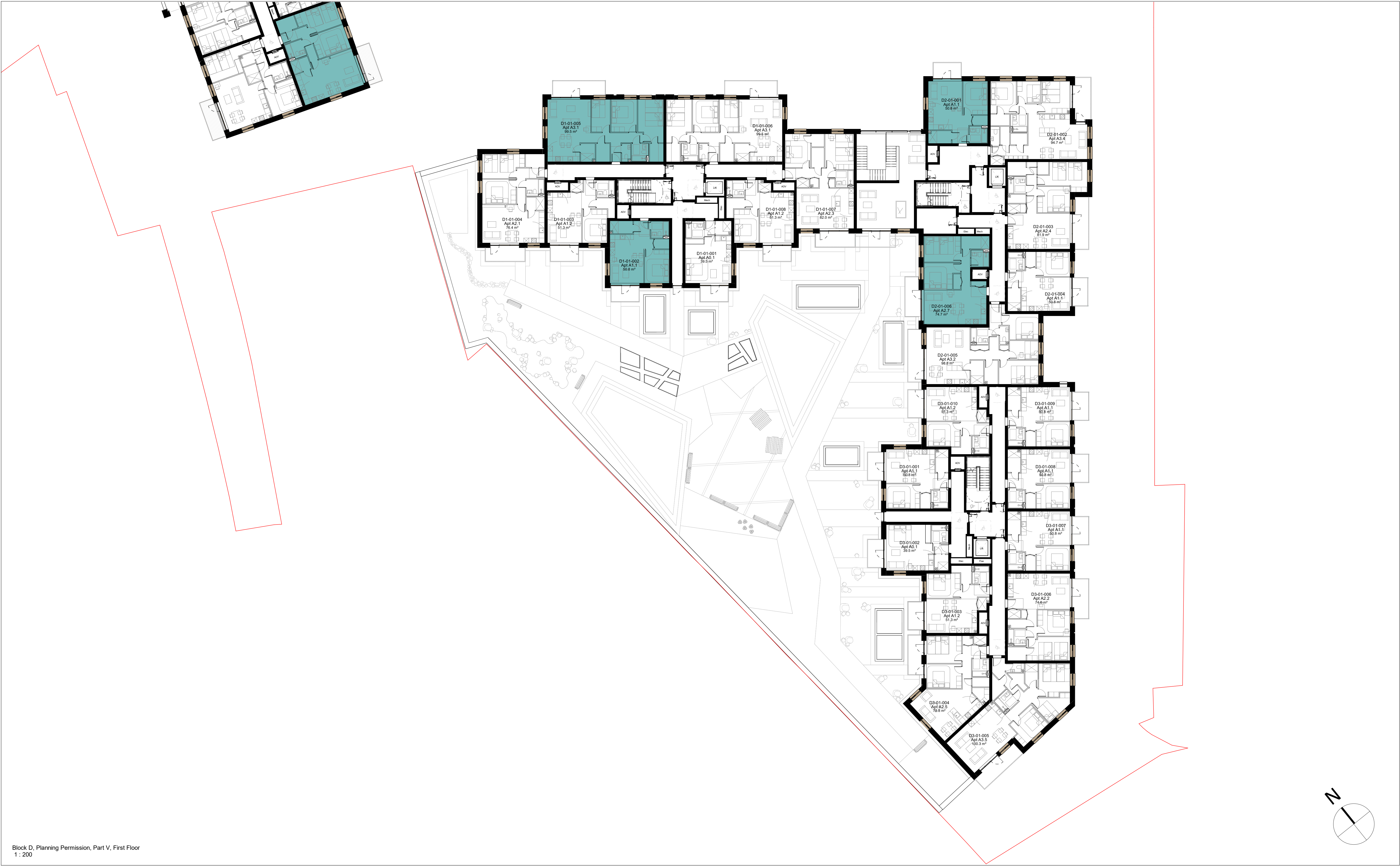
Block D, Planning Permission, Part V, First Floor 1 : 200

Notes: - Do not scale from this drawing. Use figured dimensions in all cases. - Verify dimensions on site and report any discrepancies to the Architect immediately. - This drawing to be read in conjunction with the Architect's Specification. - © This drawing is copyright and may only be reproduced with the Architect's permission. Drawing Notes: