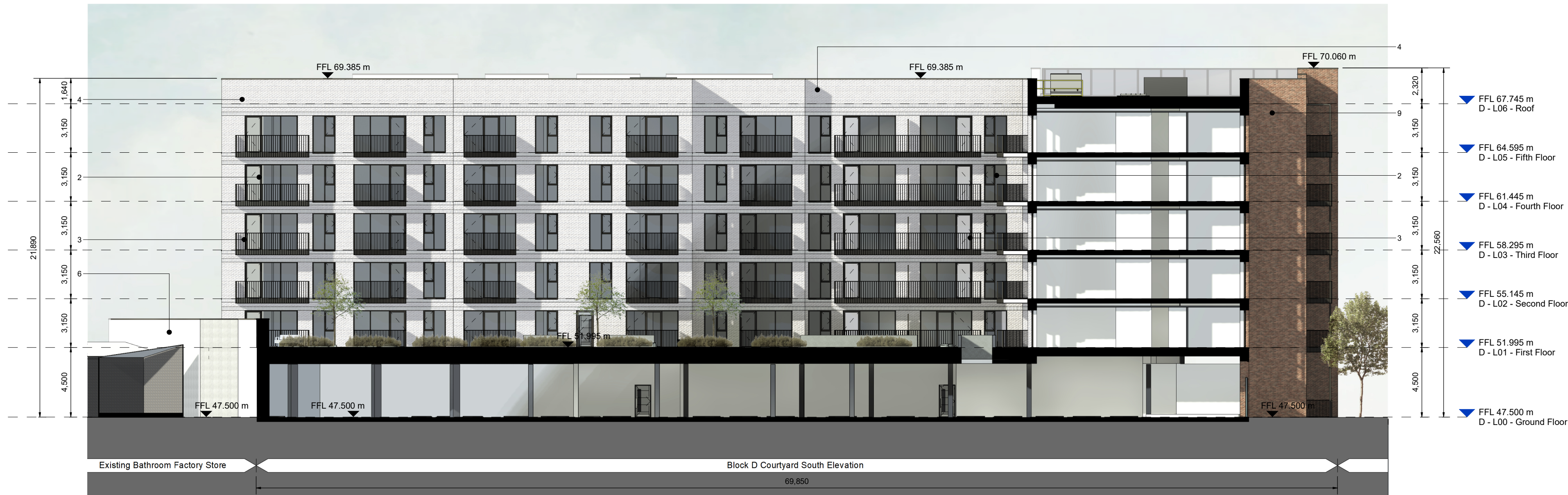
Blocks D, Planning Permission, Elevation Courtyard South 1 : 200

Notes: - Do not scale from this drawing. Use figured dimensions in all cases. - Verify dimensions on site and report any discrepancies to the Architect immediately. - This drawing to be read in conjunction with the Architect's Specification. - © This drawing is copyright and may only be reproduced with the Architect's permission. Drawing Notes: