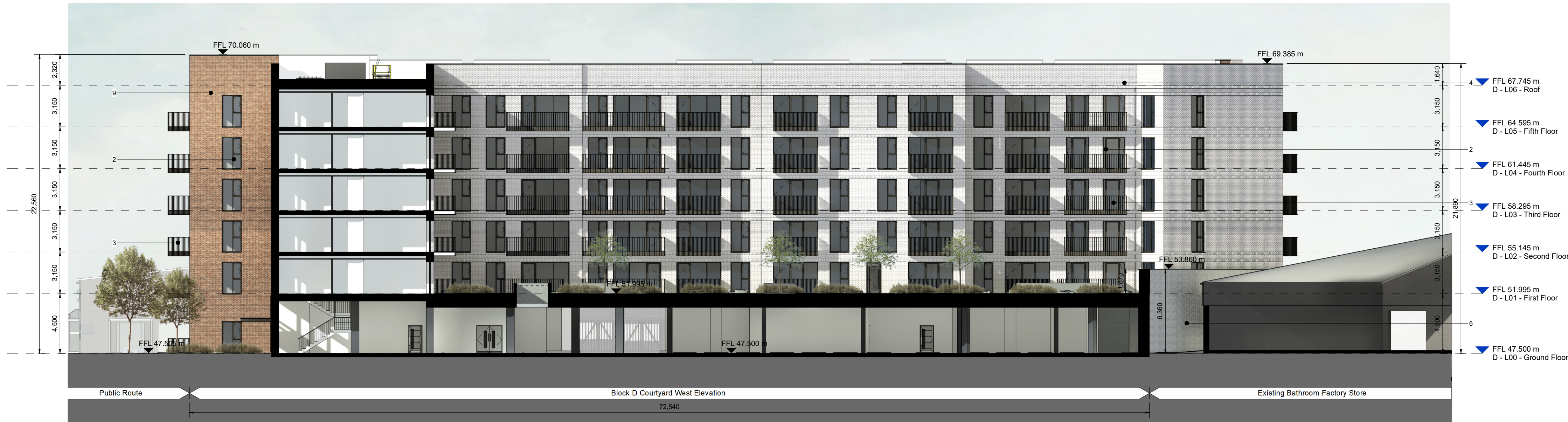
Blocks D, Planning Permission, Elevation Courtyard West 1 : 200