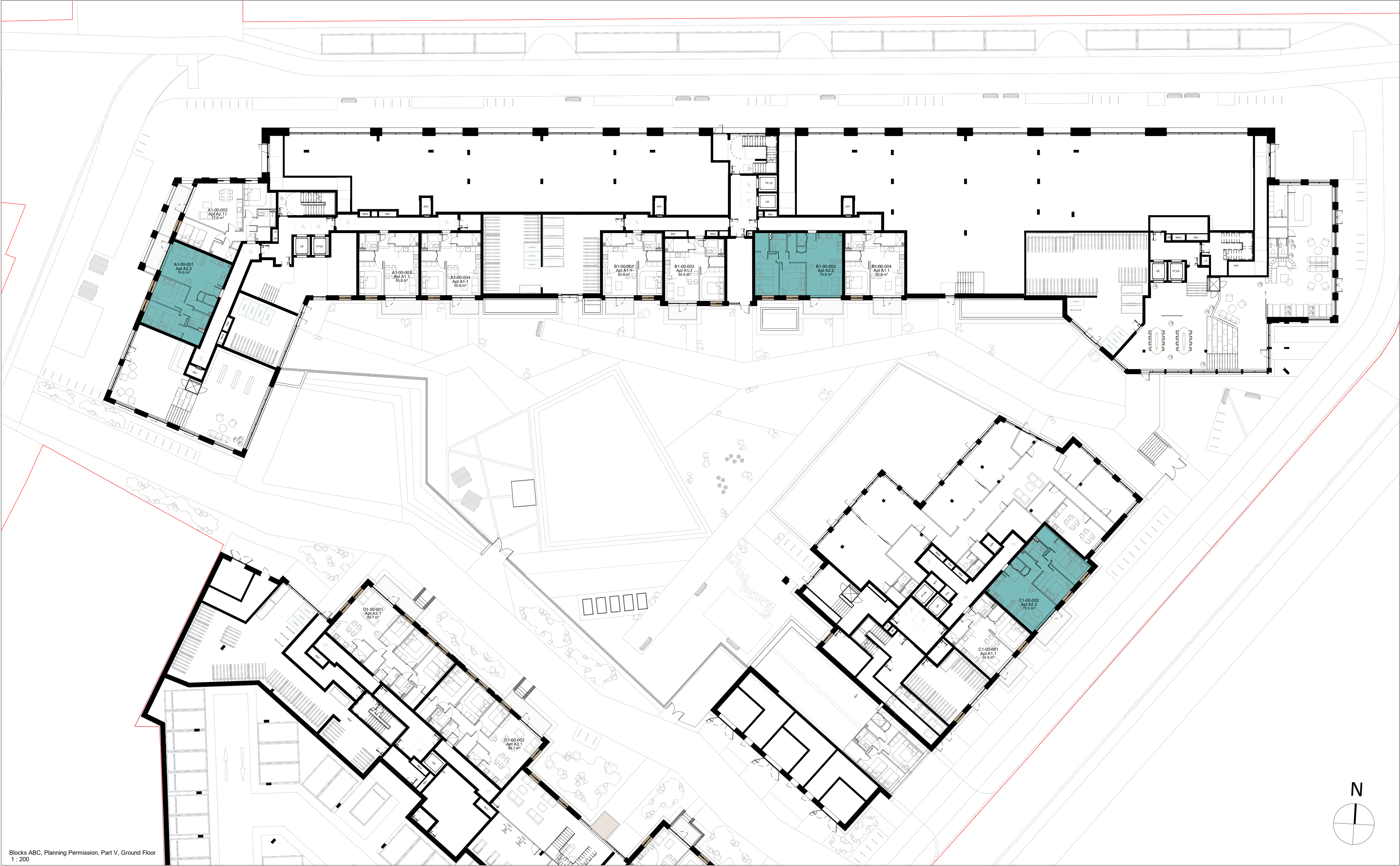
Blocks ABC, Planning Permission, Part V, Ground Floor 1 : 200

Notes: - Do not scale from this drawing. Use figured dimensions in all cases. - Verify dimensions on site and report any discrepancies to the Architect immediately. - This drawing to be read in conjunction with the Architect's Specification. - © This drawing is copyright and may only be reproduced with the Architect's permission. Drawing Notes: