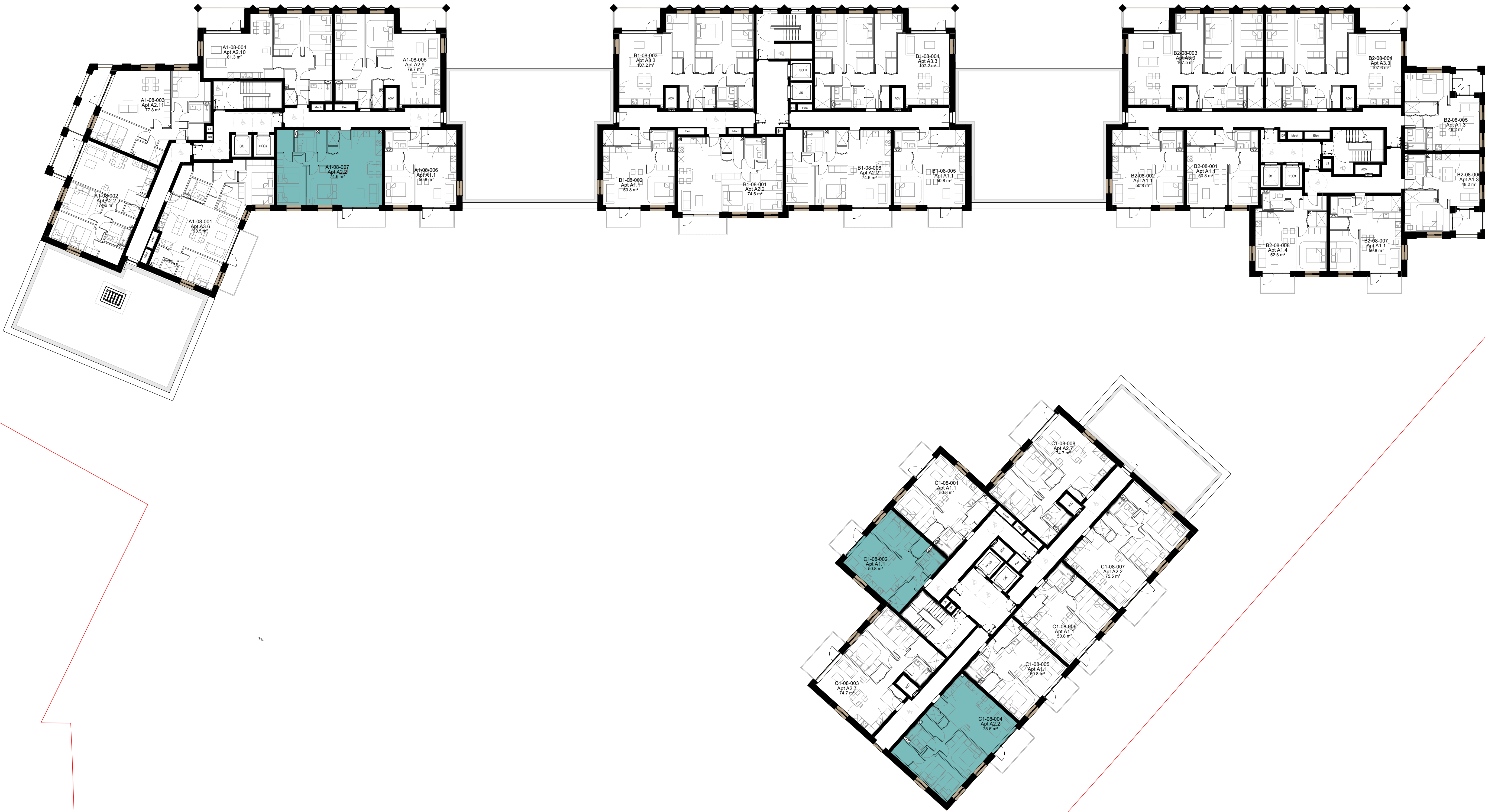
Blocks ABC, Planning Permission, Part V, Eighth Floor 1:200

Notes: - Do not scale from this drawing. Use figured dimensions in all cases. - Verify dimensions on site and report any discrepancies to the Architect immediately. - This drawing is to be read in conjunction with the Architect's Specification. - © This drawing is copyright and may only be reproduced with the Architect's permission. Drawing Notes: